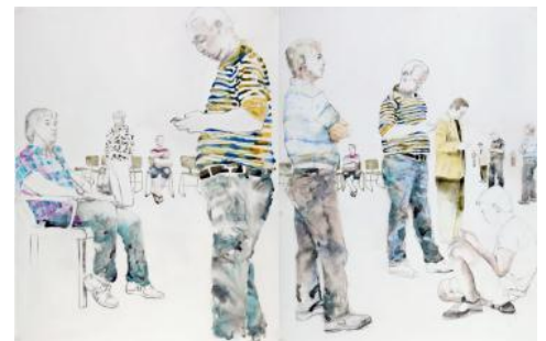
Lillian Warren Wait 1-10-11, 2012 54" x 84" Acrylic on Mylar

Lillian Warren creates a specific painting installation to cover the walls of the Grace R. Cavnar Gallery with a continuous series of figures. Foreground figures are life sized or larger and others diminish in scale and recede into empty space. Through repetition of figures throughout the paintings, Warren implies reflections, passage of time and a shifting point of view. Each figure seems to have been waiting for a long time, glancing up to see if something has happened, absorbed with some electronic gadget, staring into space, or even sleeping; oblivious to the others, although clearly inhabiting the same space and all waiting...for something.