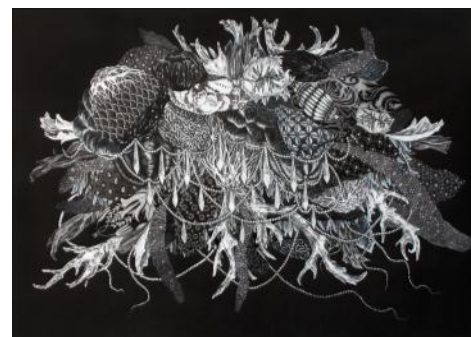
Angela Piehl Chandelier , 2011 Color pencil on black paper 38" x 56"

Lonely Hunters is a series of drawings that feature the accumulations, creatures, and hybrids of flora and fauna, in the dark environments that Angela Piehl incorporates into her work. Piehl's accumulation drawings reference luxury and opulent decay, recombining elaborately decorative elements with organic material like flesh, hair, tentacles, eggs, fat, bone, muscle, crystalline structures, and wood. The title, Lonely Hunters , references the Southern Gothic literary genre, and like characters within the genre, Piehl's creatures are solitary-- at once seductive and repellant, grotesque and beautiful. Piehl's pieces include large-scale framed graphite drawings, mid-sized and large-scale white and grey pencil on black paper drawings, and small-scale graphite drawings.