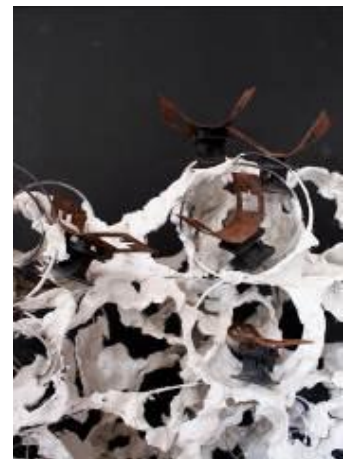
Sharbani Das Gupta Chemosynthesis (detail), 2012 Found scrap, raw clay, wax 45" x 24" x 6"

REady MADE features the work of six artists who integrate discarded items with clay and ceramic processes as a means of personal expression. Through this investigation the works transform from being "ready mades" to being re-