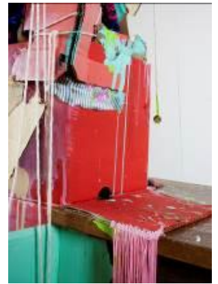
Katie Wynne A chain of non-events (detail), 2013 Site specific installation