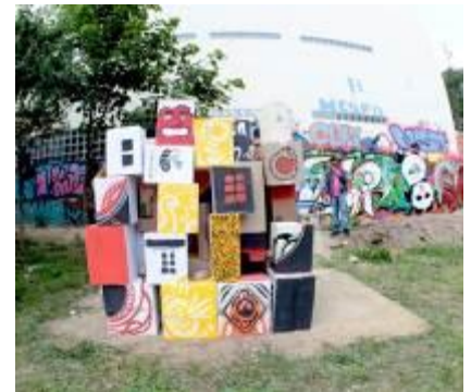
Rahul Mitra Box City , 2012 Spray paint, acrylic, markers on recycled cardboard boxes 5' x 5' x 5'

Rahul Mitra's Box City , constructed of hundreds of painted cardboard boxes he recycles from trash, echoes slums of his native India and Favela shantytowns. For the last four years, Mitra has been engaged internationally in Europe and India in a critical observation and interpretation of social, economic, political and cultural aspects of the urban centers of the world to question what makes us different or similar. Architecture around the world is a record of human civilizations from the ancient to modern day, and distinguishes economic and social levels of its inhabitants. Slums and Favelas are commonly seen as an urban blight and residence for the destitute. The growth of the Slum/Favela is a reflection of the disparity and economic division in a culture, but having grown up in similar environment, Mitra sees the slum as a ' resilience of hope ' that is in a precarious balance with the rest of society. Seemingly, a small nudge is all that is needed to make these structures crumble, yet they seem to live on and grow just like the people building and occupying them.