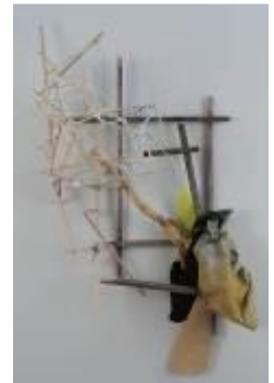
Alexis Granwell Eternal City , 2011 39" x 19" x 15" Handmade paper, wire, wood, latex paint

Curt Gambetta's work in light is sited around spaces and objects that oscillate between urban dereliction and zones of speculation and potential development. Gambetta constructs lighting conditions that register either as a ghost of what lies neglected and erased, or a mirage of what might come. The installation, Office Light , is comprised of a 2x4' office ceiling grid containing 12 fluorescent troffer lights that illuminate the empty space behind Lawndale Art Center. All architectural presence is stripped away and remains only as a trace, reducing office light to its purest form of transmission. The ceiling hangs just below eye-level, disallowing pedestrian access and suggesting that it be viewed from afar, from the vantage point of the street. All aspects of construction are standardized technologies that are used in this installation in order to be easily re-constructed at other sites, within and outside Houston. In this way, the project is designed as a prototype for future illuminations.