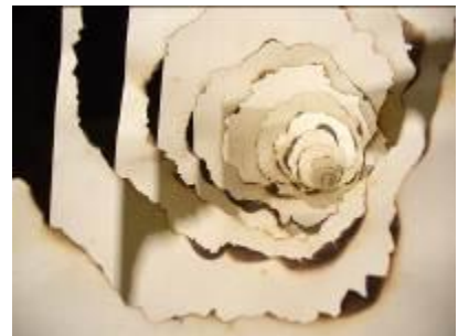
Darcy L. Rosenberger Untitled (Burn) , 2010 Dimensions variable Paper burned with matches, monofilament, metal rings

Darcy Rosenberger utilizes the medium of the gift throughout her work to explore and express the innumerable forms of love. The exhibition This is for You displays things that were made for very specific people, to capture the beauty of these fleeting individuals, experiences, and relationships as well as the blindingly beautiful qualities of the present. A wide range of media is employed to make very personal, almost secret, communications to particular people with the hopes of connecting to the greater public through their own storehouses of personal experiences and relationships. Physical, visual, tangible communication that is so highly personalized as this gift-based work is something that is easily lost in our increasingly impersonal and virtual-based society. This tradition of artifactual human connection needs to be pushed to stay alive.