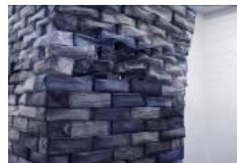
Carrie Scanga View From High Places , 2010 Dimensions variable (site-specific) Etching printed on tracing paper, string