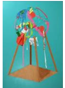
Daniel McFarlane Aqua Quartz II , 2010 Acrylic on panel 48" x 36"