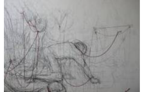
Carmen Flores Encounter (detail), 2010 Graphite, watercolor and thread/canvas 49x99x1 inches

Carmen Flores' drawings explore the proliferation of violence in the culture and its impact on the human psyche. After being in a violent environment for a long period of time, people change behaviors and activities in order to be safe. The acceptance and normalization of violence is part of the process of desensitization in our society. The imagery in Flores' work is drawn from personal safety tutorials, police reports and press accounts of violence drawn in graphite and chalk. The ephemeral quality of chalk speaks of the physical vulnerability of violence and, the remains of erased layers allude to the remembrance of victims.