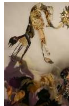
David Waddell Untitled Collage, 2009 Spray-paint, magazines, photocopy, vellum 30"x 40"