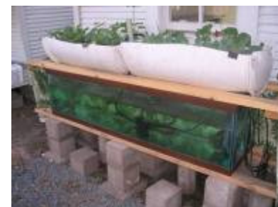
Malcolm Smith Fish Tank & Grow Beds Aquaponics prototype Mary E. Bawden Sculpture Garden

Aquaponics is a high-density food production arrangement that produces both plant matter and fish in one system with an absolute minimum of water usage. Very little power is required to operate the Aquaponic system. The lower part of the system houses the fish that create the fertilizer for the plants. The plants are contained in what is called a "grow bed" which sits above the fish tank. A single water pump propels nutrient rich water from the fish tank to the grow bed(s). Plants become a natural filter as they absorb nourishment from fish waste, reducing or eliminating the water's toxicity for the aquatic life while the water fills the plant container. Once the plant container is full a device known as an "auto siphon" drains sparkling water effortlessly back to the fish tank using only the power of gravity. No external power is needed for the auto siphon to operate. The water, now clean, is returned to the marine animal environment and the cycle continues.