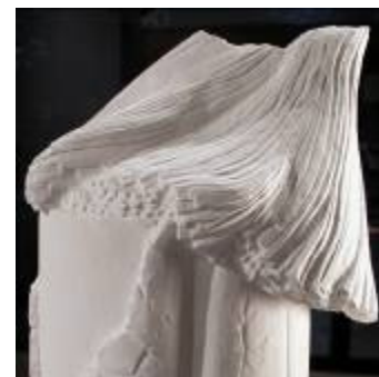
Lily Cox-Richard The Stand , 2010 Plaster 70"x20"x20"

Lily Cox-Richard is interested in the historic and commemorative roles of sculpture, from public monument to personal grave marker. Her current work explores the power of icons and objects, and how this power shifts with time, context, and readability. The Stand is an exhibition of new work exploring the props used in neo-classical sculpture to shore up both structure and allegory. In Hiram Powers' 1872 marble The Last of the Tribes , a Native American woman flees western civilization. As she runs, the edges of her skirt flip as they brush past a tree stump. In Lily's sculptures, these props and trappings are freed from their roles of symbol and support and reinvested with new visibility and presence.